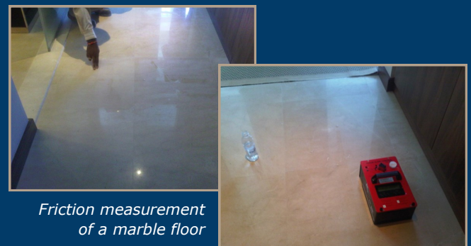
Friction measurement of a marble floor

After treatment the friction of the floorings will be increased dramatically.