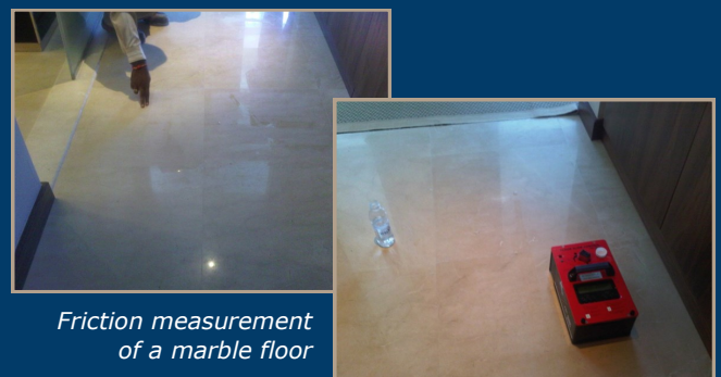
Friction measurement of a marble floor

After treatment the friction of the floorings will be increased dramatically.